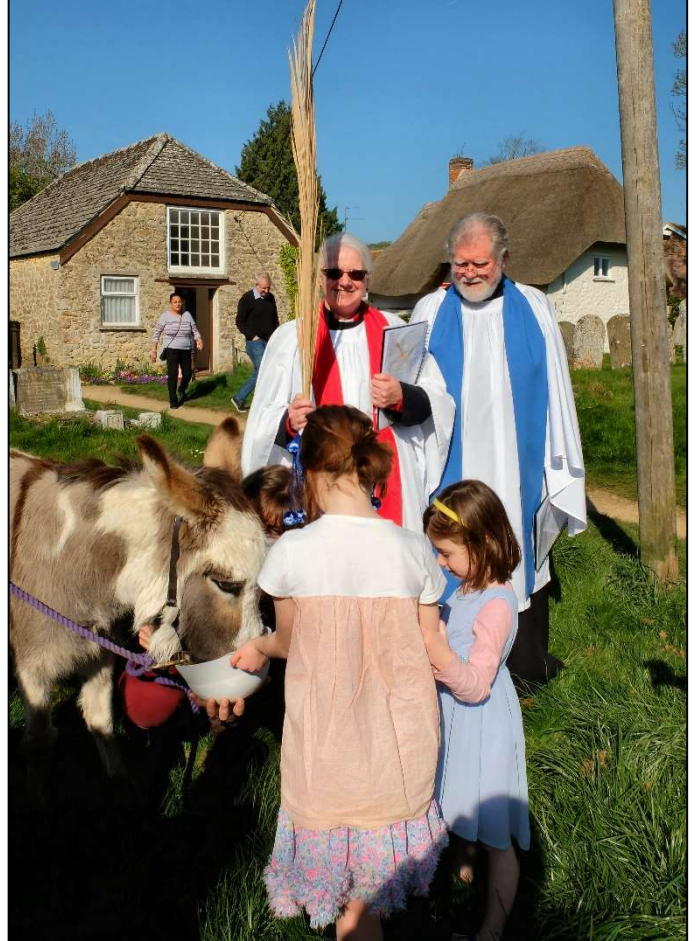
Palm Sunday 2017