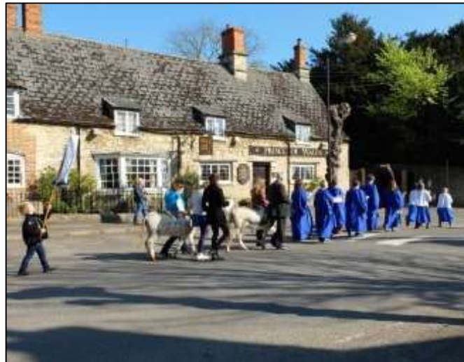
Palm Sunday 2017

Size, shape, colour, style really doesn't matter – and although I say knit or crochet any other creative ways of producing them would be fantastic too. They simply need to be able to be displayed in some way. I don't mind if it's one, or two, or twenty or two hundred – this might be a way to look forward with a little bit of hope in our hearts to brighter times ahead.