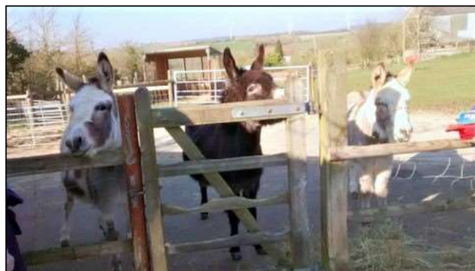
Sorry we can't be with you on Palm Sunday!